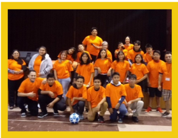
The Holy Spirit Youth Group at Christ the King wearing their VZF T-shirts!

The Holy Spirit Youth Group at Christ the King parish in Long Branch is a group of over 40 students of different ages. Seeing a need to help the youth of the parish, a few dedicated parishioners got together and decided to moderate the group. After a vote, the students choose their name in order to honor the Holy Spirit. The group offers the students a place to hang out, a place to pray and a place to do some extracurricular activities that they may not have access to, such as music, art and field trips. We are happy to have this group as part of the VZF family.